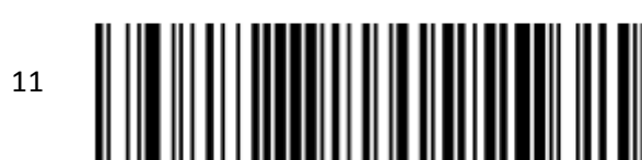
11 GS1-128 = Transmit in Code 128 data format