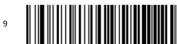
9 UPC-A Number System Character = Do not transmit