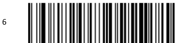
6 EAN 13 Check Character Transmission = Don't Send