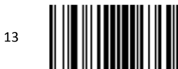
13 ENTER/EXIT PROGRAMMING MODE