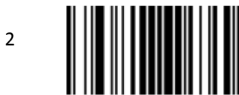
2 ENTER/EXIT PROGRAMMING MODE